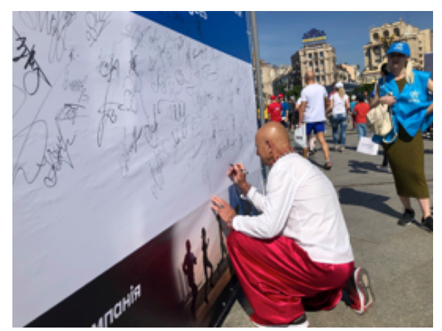
UNHCR was present at Kyiv's traditional "Chestnut Run" event. During the event, UNHCR volunteers explained to runners how they could dedicate the kilometers they would run to the refugee cause as part of the "2 billion kilometers to safety" campaign.

Households in eastern Ukraine have benefited from UNHCR shelter assistance in 2019.