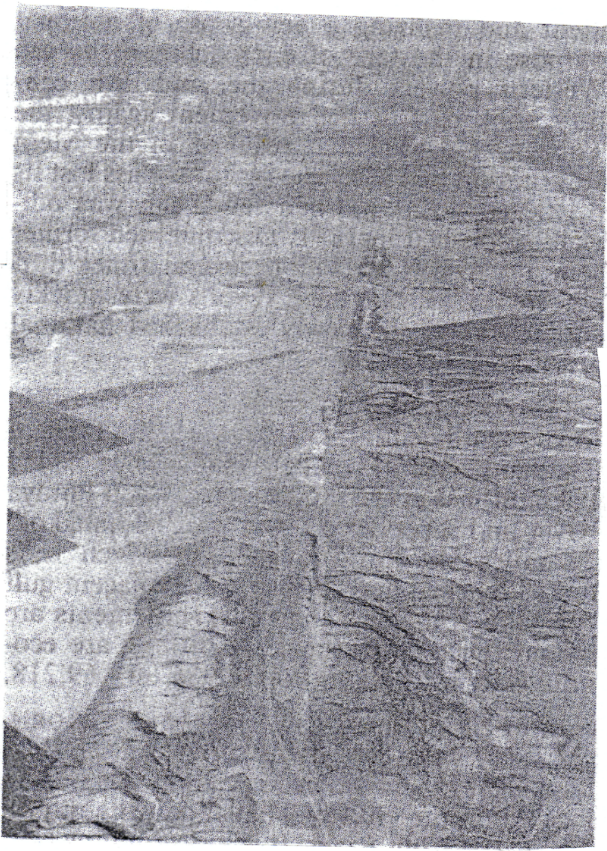
San Andreas Fault, California